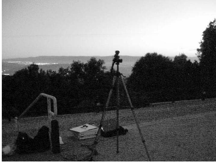
Figure 2: Cameras set up at Fremont Peak Observatory.